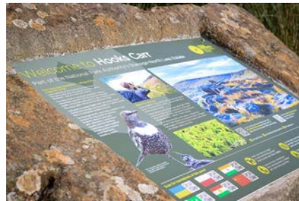
The information boards