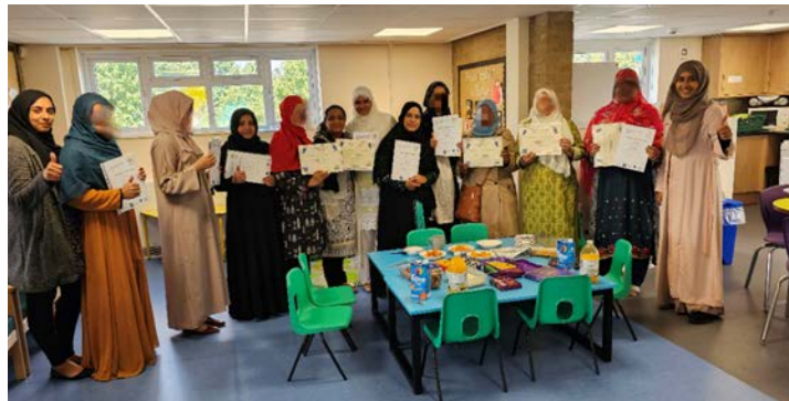
The group receiving their certificates