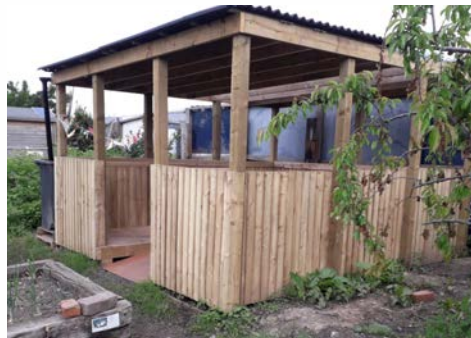
The new shelter