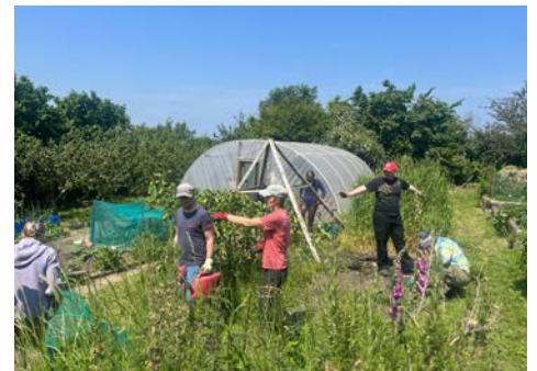
Busy on the allotment