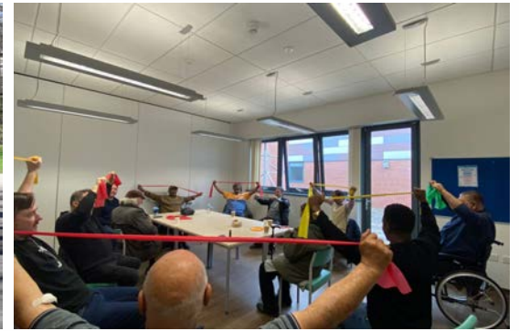
Monday Health Walk and Men's Health Group sessions in action