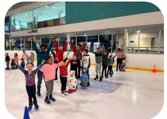
School holiday fun

Through our HAF programme we have also delivered around 3,300 packed lunches to children and families following their activities.