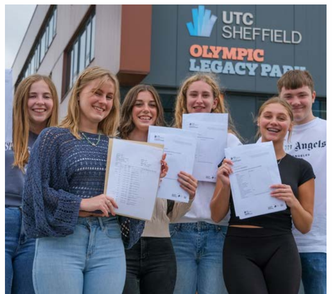
A Level students celebrating their exam success

A Level students are progressing to a range of top destinations including the University of Cambridge and Kings College London.