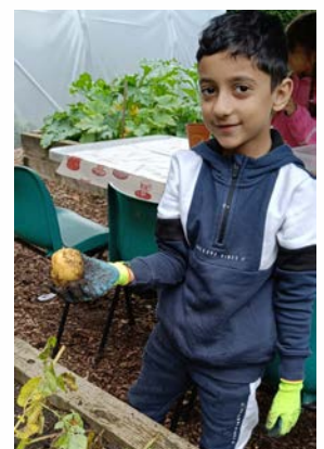
Activites at the allotment during the summer