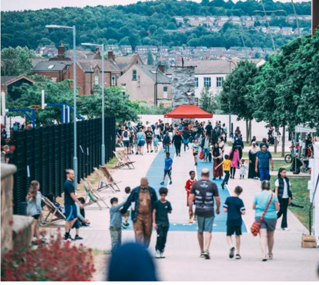
Olympic Legacy In Action fun more details on p7

Welcome to the Autumn 2023 Community Connector. In this edition we look back at some of the events and activities held in the local area over the summer and we also look forward to what's coming up in the autumn - including the opening of the Canon Medical Arena at Sheffield Olympic Legacy Park.