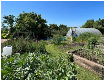
The allotment in summer

Everyone is welcome to come along to our Grow Together allotment session, Fridays 10am-1pm. No gardening experience necessary. You can also follow us on Facebook and Instagram.