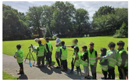
Enjoying the summer activities

Evergreeny went full swing on her maiden summer camping sprint back to back for five whole weeks. Leaving little ones enriched with abundant knowledge of the beautiful planet they live on. It has been an absolute pleasure to have engaged with the children in various ways. They really did bloom with confidence and gained an awesome hands on experience from making ice creams, kites and plastic to beekeeping while giving back a little bit to their environment: "A cleaner greener future" being the highlight of the labs that aimed to instill the importance of the ecosystem as a whole.