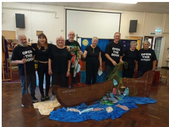
Telling the story of Jesus and his friends

Open the book is an exciting storytelling project where scripted bible stories are shared with children in a way that is fun, interactive and memorable. We use props to bring stories to life, sometimes wearing costumes and using songs. We encourage interaction between all the