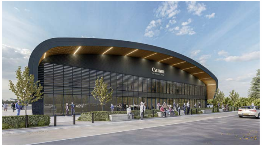
Canon Medical Arena

The Canon Medical Arena will be officially opened in October. It is a new premier sports and entertainment facility situated on the Sheffield Olympic Legacy Park. The purpose-built venue will be the permanent home of the Sheffield Sharks and Sheffield Hatters basketball teams, in addition to various other sporting collectives, including DNC Netball and Sport Sheffield (University of Sheffield). The Arena will be able to host a diverse spectrum of events. From sporting spectacles to live musical performances, as well as corporate events, the arena is designed to cater to a wide array of engagements.