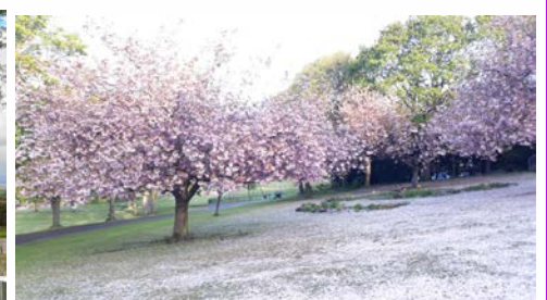
Scenes from High Hazels Park