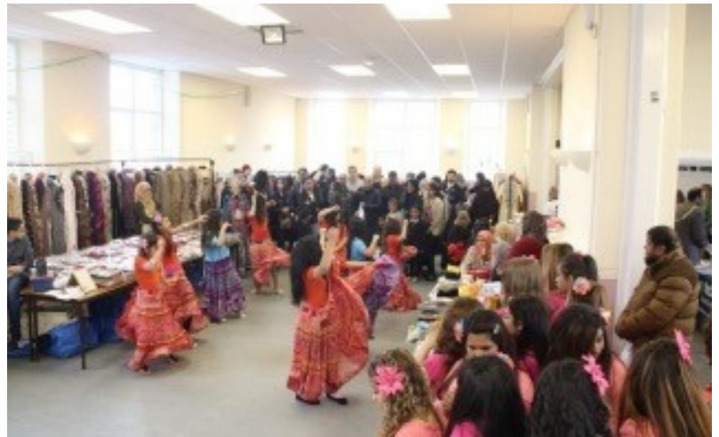
A celebration event at PMC