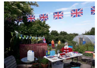
Jubilee celebrations on the plot

We had a wonderful Jubilee celebration on the plot, with 56 people attending. There was a coconut shy, tin can alley, hook a duck, royal memorabilia, a raffle, plants to take home and, of course, a feast fit for a queen!