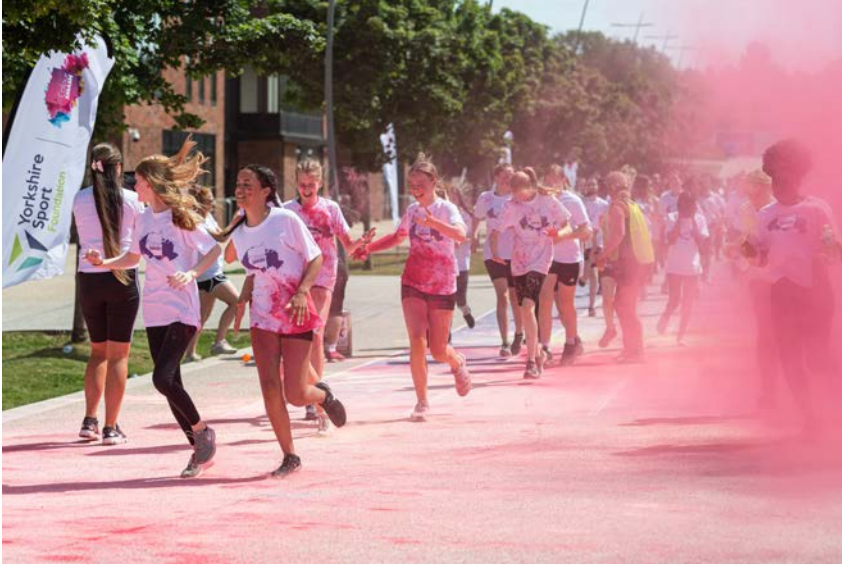
School children enjoying the 'Colour Smash' at the Olympic Legacy in Action event - more on p7

Is there something you think we should cover next time?