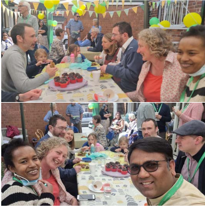
Galeed House birthday celebrations

On April 30th and in the week following, Galeed House opened its doors to celebrate 21 years since the house was opened. Galeed means “place of meeting” and the vision of the Christians who founded it was to provide a space for all the diverse members of the community in Darnall to meet in peace and friendship, to break down barriers of hostility and grow in understanding and appreciation of our differing cultures and faiths. That vision has not changed over the years and Galeed continues to offer free English classes for both men and women, after school and holiday clubs for children and a ladies' sewing class with friendship and conversation, followed by a free lunch. Over these many years, our volunteers have built deep friendships with the