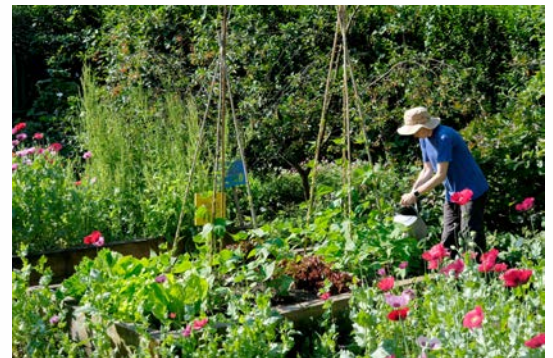
Tinsley Allotment in bloom

This summer at Tinsley Community Allotment we will continue to run our afternoon sessions from 1-3pm on Fridays. These sessions are open to anyone who wants to come along and help us do some gentle gardening. We welcome help with watering, weeding and harvesting crops. If you prefer, you are welcome to just sit and enjoy the green space. Children are welcome, but must be accompanied by an adult. We will be closed for one week on September 2nd. After this, our Thursday morning toddler group will resume. If you have any questions email us on tinsleyallotment@gmail.com , look us up on Facebook, or just drop in to say hello. We can be found in the car park behind Tinsley Forum, at 120 Bawtry Road, S9 1UE.