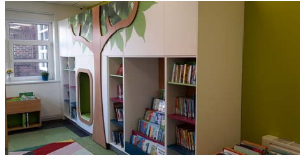
The children's section at Tinsley Library

or pop into the Tinsley One Stop Shop on Tuesday, Wednesday or Thursday 10am - 2pm to find out more.