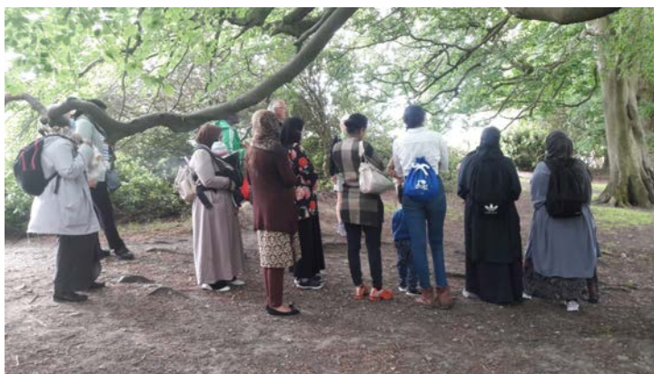
Scenes from our recent Green Social Prescribing walks