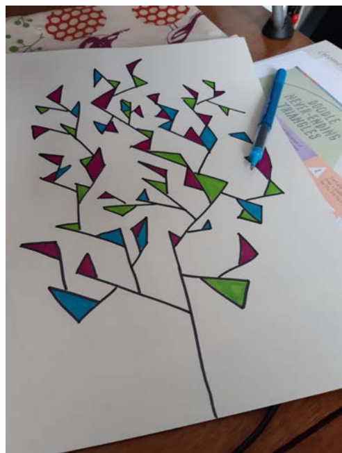
Artwork from a recent FACES session

If you are interested in digital skills, childcare, family history, customer service skills, and health and social care, then contact us early to book your place. We are available for you to talk to throughout the summer.