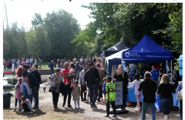
2021 Waterfront Festival