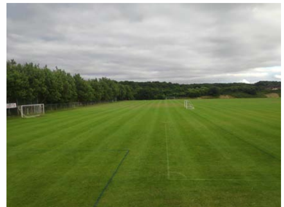
Grass pitches at the Urban Centre

We understand the social and cultural needs of our very diverse communities, and our aim is to create a warm, friendly and welcoming space for everyone.