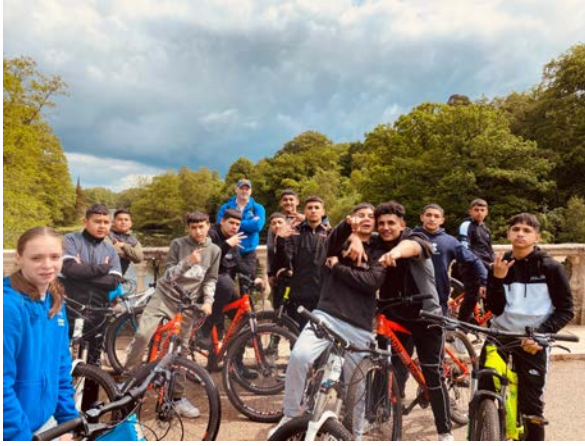
Youth Club at Clumber Park

Community Youth Services continue to deliver open access youth provision in Darnall on a Monday and Wednesday evening, 6-8pm at Darnall Education Centre. All welcome, aged between 12 and 17. Young people have taken part in a number of sports activities including cricket and swingball. A mini football tournament on Phillimore football pitch ended with the winning team receiving medals, and player of the match won a Meadowhall voucher. Youth workers have delivered a curriculum around healthy relationships and respect, and had discussions with young people about being respectable