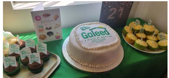
Galeed House birthday cakes